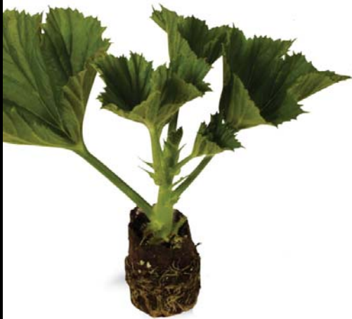
REGAL SINGLE SHOOT CUTTINGS (1-C PRODUCT)